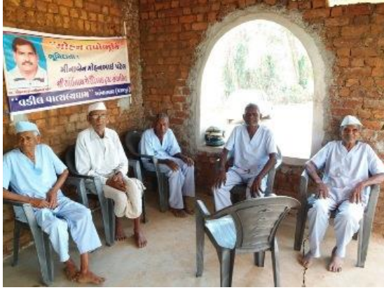
Some seniors staying at Vadil Vatsalyadham at Zero charge.